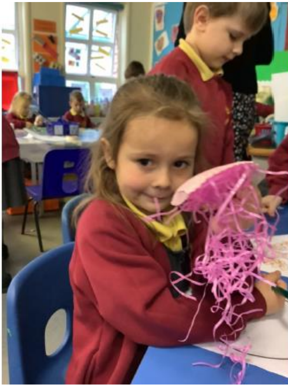
Autumn 2 - choosing tools and materials to independently make a jellyfish.