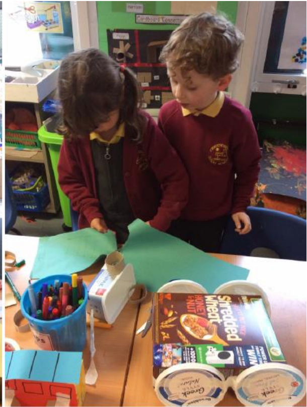
Autumn 2 - designing and making a fire engine from junk modelling recycled materials.