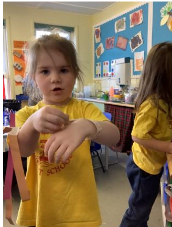
Autumn 2 - choosing tools and materials to independently make a bracelet.